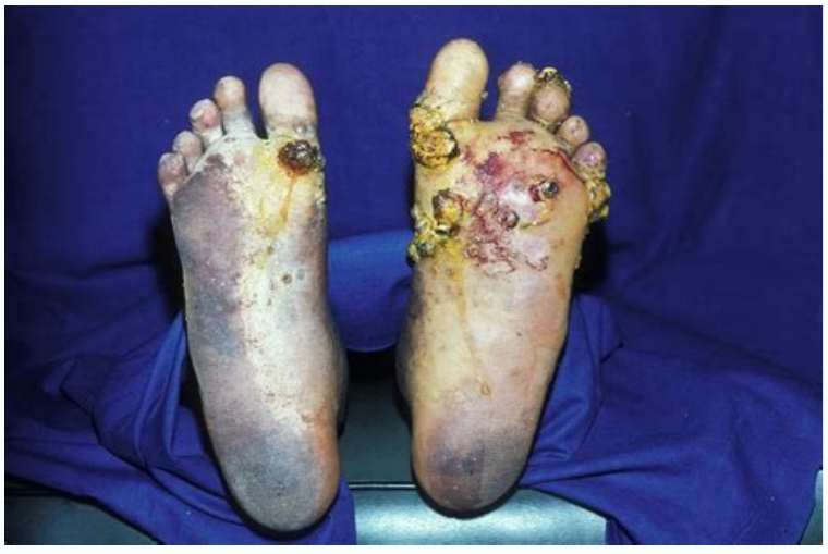
Kaposi' s varicelliform eruption